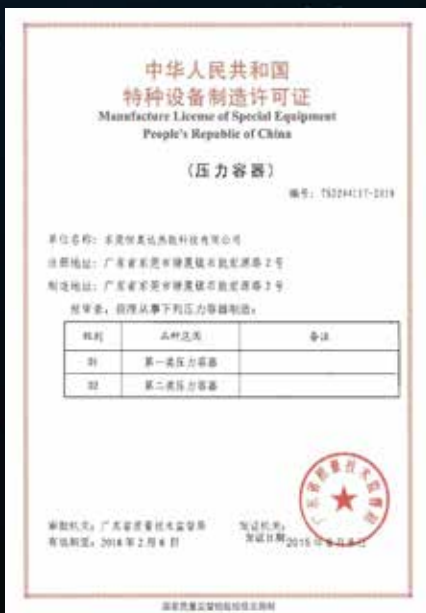
Manufacture License of Special Equipment