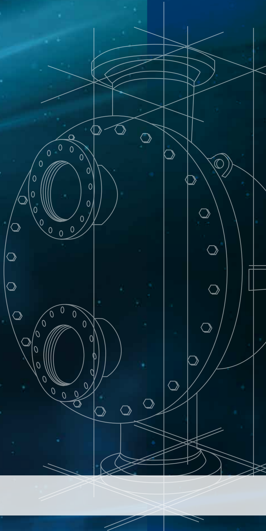
PLATE & SHELL HEAT EXCHANGER